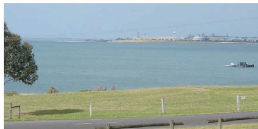
Views of Point Henry from Eastern Park