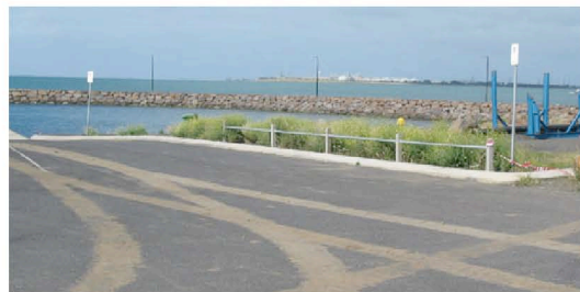
Views of Point Henry from Limeburners Point