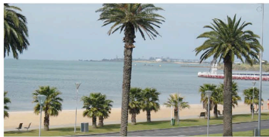
Views of Point Henry from Geelong Waterfront