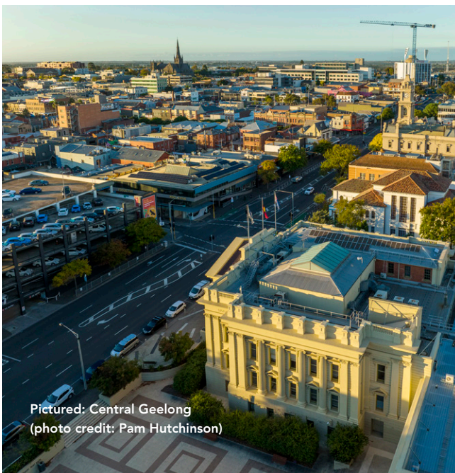
Pictured: Central Geelong

An online survey was sent via email to stakeholders with an invitation to also participate in individual and group interviews in early November 2022.