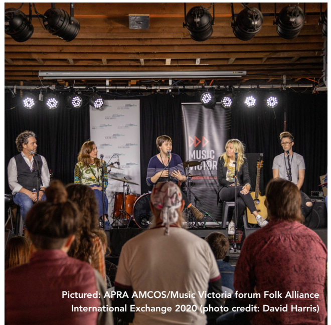
Pictured: APRA AMCOS/Music Victoria forum Folk Alliance International Exchange 2020