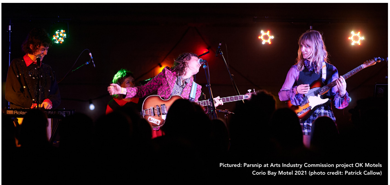
Pictured: Parsnip at Arts Industry Commission project OK Motels Corio Bay Motel 2021

As the plan developed and government efforts shifted due to the pandemic disruption, some of the action items were broadened to include the Greater Geelong area. Other actions were modified to better suit the often fast-changing circumstances.