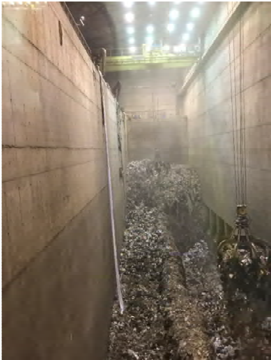
Waste to Energy Plant Turin – Trattamento Rifiuti Metropolitan – Waste Bin