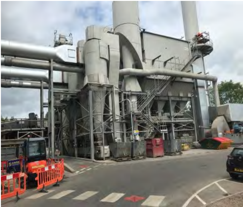
Waste to Energy Plant - Dundee