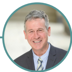
BHarwood Bruce Harwood Mayor of City of Greater Geelong