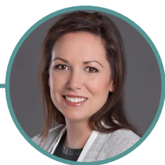
Jaclyn The Hon Jaclyn Symes Victorian Minister for Regional Development