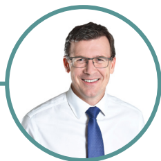
AT The Hon Alan Tudge MP Minister for Population, Cities and Urban Infrastructure

This Implementation Plan sets out the commitments and delivery milestones for the projects. Annual Progress Reports will provide updates on the delivery of key commitments and performance against agreed measures and the formal Three-Yearly Reviews will assess whether the City Deal is delivering in line with the initial vision and objectives of the Deal.