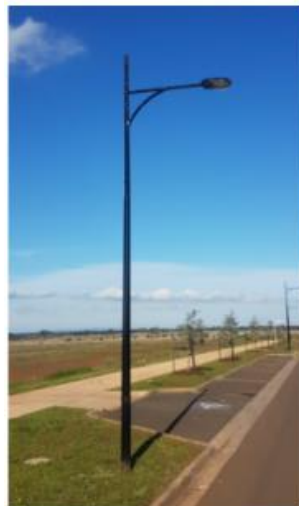
Decorative - Manningham