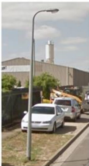
Standard (P Category)