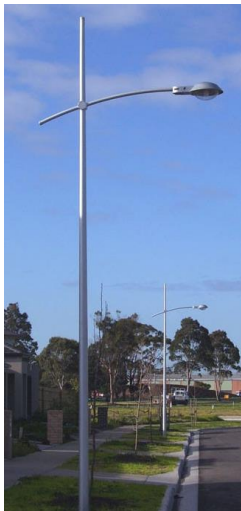
Decorative - Lincoln