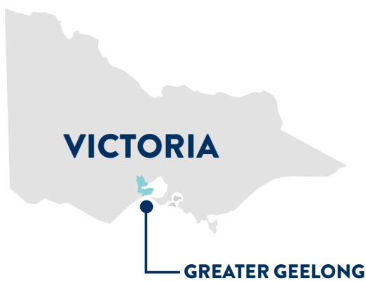
Figure 1: The City of Greater Geelong ward map and context map