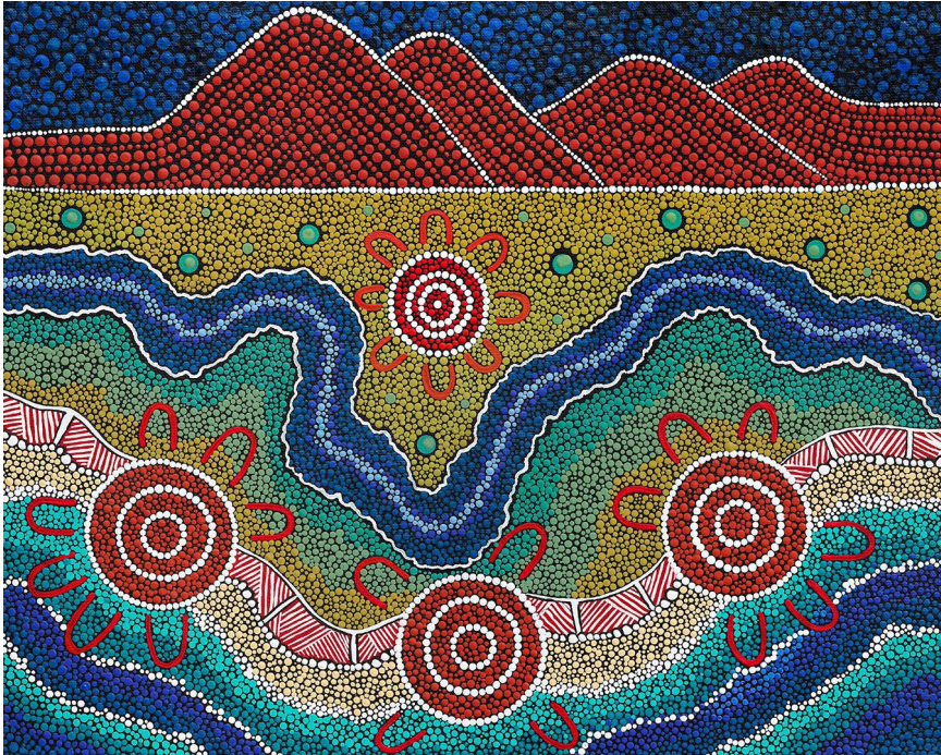
Artwork: On Country by Ammie Howell.

The City of Greater Geelong acknowledges Wadawurrung people as the Traditional Owners of this land. It also acknowledges all other Aboriginal and Torres Strait Islander People who are part of the Greater Geelong community today.