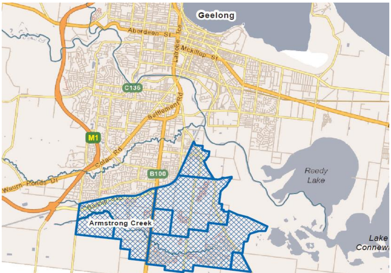
Location map of the approximate Armstrong Creek growth boundary within the Greater Geelong municipality

Economic Impact: High housing costs can deter new residents and businesses from moving to Geelong, potentially slowing economic growth. Affordable housing is crucial for attracting and retaining a diverse workforce.