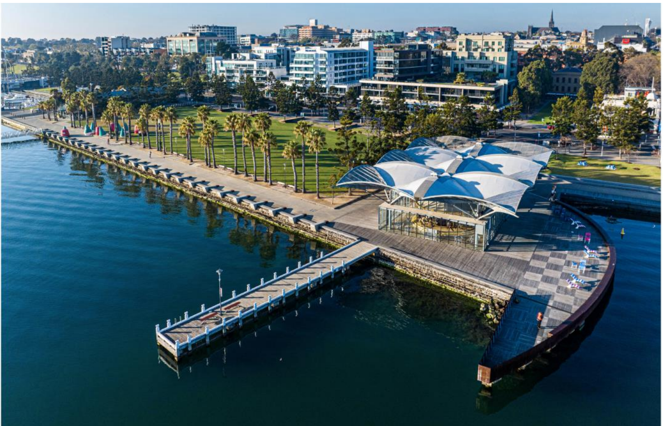
The Geelong Waterfront

The municipalities culturally and linguistically diverse communities also continue to increase. A total of 17.7 per cent of the municipalities total population were born overseas. Migration has been key to the development of the region and today, the City welcomes new arrivals from countries such as Afghanistan, Iran, Iraq, South Sudan, Congo, and Myanmar. International students are also an important part of the rich multicultural fabric of the region.