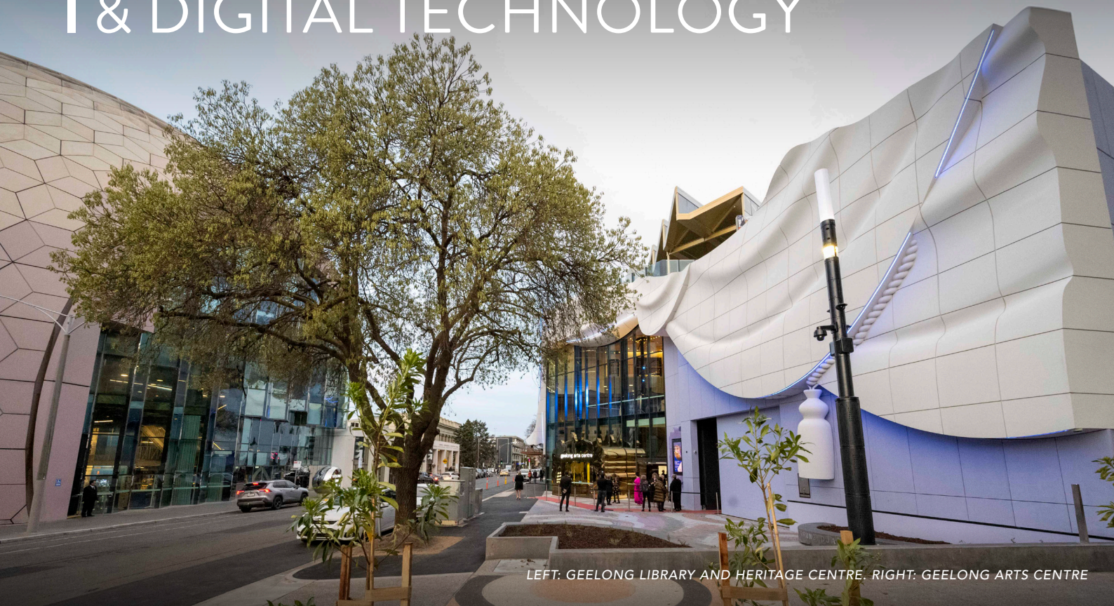
LEFT: GEELONG LIBRARY AND HERITAGE CENTRE. RIGHT: GEELONG ARTS CENTRE

Design, screen and games, visual arts, music and performing arts, advertising and digital content services clustered in flexible studios and co-working hubs.